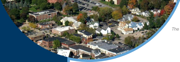
The historic "downtown" area of Franklin, Mass.