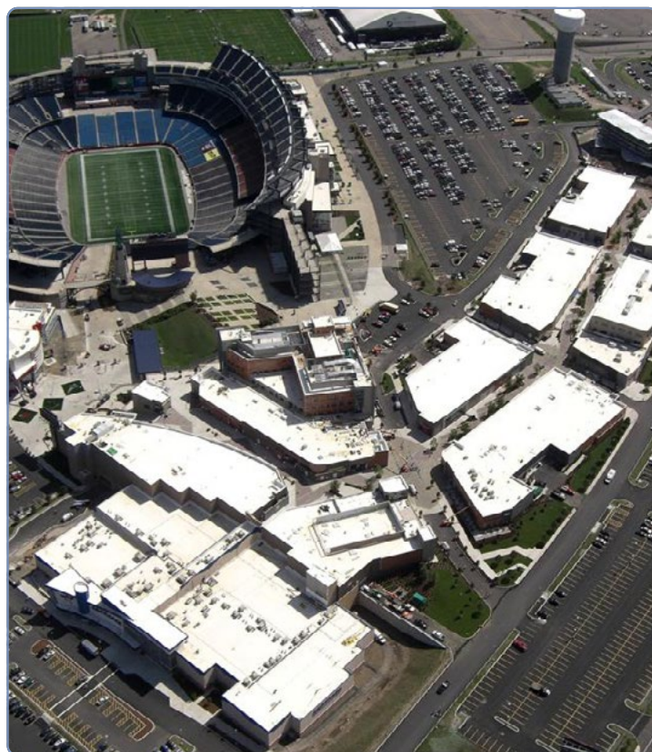
Patriot Place, located next to Gillette Stadium in Foxboro, is a sprawling development that features restaurants, bars, and places to shop.