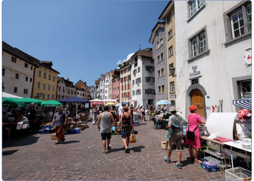
Chur is a wonderful tourist destination with beautiful sights and much to offer.

Visitors wishing to discover the town independently should follow the routes marked with red signposts. The Domleschg area is dotted with castles and fortresses, including the privately owned Rietberg Castle, famous for its connection with Jürg Jenatsch, a local freedom fighter who played a decisive role in the colorful history of the canton of Grisons (Graubünden).