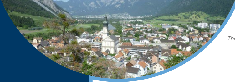
The scenic village of Domat/Ems, Switzerland.